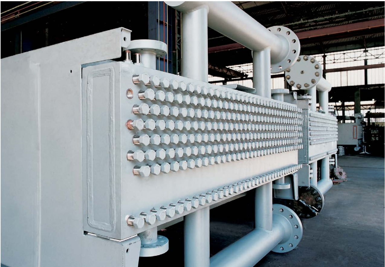
Air-cooled heat exchanger with bundles in duplex and alloy 6Mo

The design of our transfer line exchangers (TLEs) is a good example of how we create value for our customers through smart engineering. Alfa Laval Olmi TLEs have a patented design that makes them withstand the harsh conditions in quench cooling in ethylene plants much better than traditional TLEs.