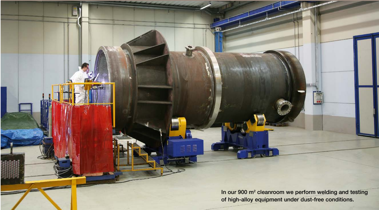
In our 900 m 2 cleanroom we perform welding and testing of high-alloy equipment under dust-free conditions.