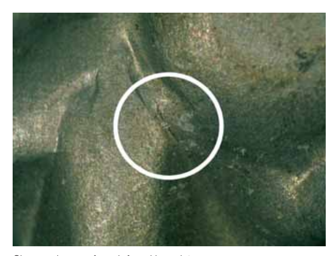
Close-up image of crack found in a plate.

Alfa Laval support ensured that the customer's heat exchanger was replaced with a new unit that has many more years of reliable service ahead.